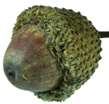
BUR OAK (QUERCUS MACROCARPA MICHX)