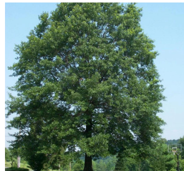
PIN OAK ( QUERCUS PALUSTRIS )