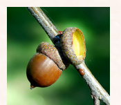
RED OAK (QUERCUS RUBRA)