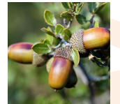
PIN OAK (QUERCUS PALUSTRIS)