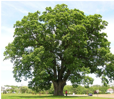
WHITE OAK ( QUERCUS ALBA )