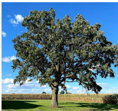
BUR OAK ( QUERCUS MACROCARPA MICHX )