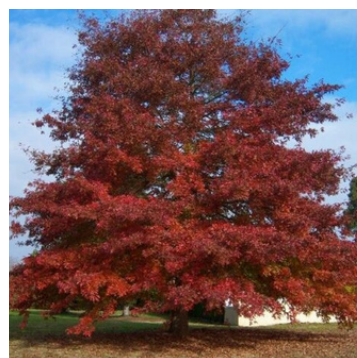
RED OAK ( QUERCUS RUBRA )

Oaks bring great beauty to our yards and provide valuable habitat for the songbirds we enjoy and the food sources they depend upon. They are a key species in a healthy well-functioning local ecosystem.